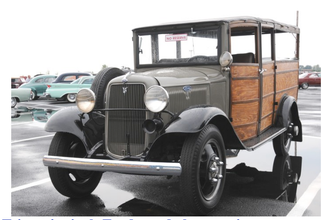
Trigger's rival: Ford woody has a unique past

At first glance, it looks like another Ford V-8 woody from the early Thirties, not that there's anything wrong with such an item. You looked it over, though, and realized it was different. RM Auctions, debuting its Auctions America sale last